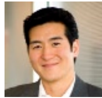
TIM CHANG - Principal, Norwest Venture Partners (Palo Alto)