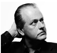
MARTYN WARE - Human League, Heaven 17, Illustrious Company (London)